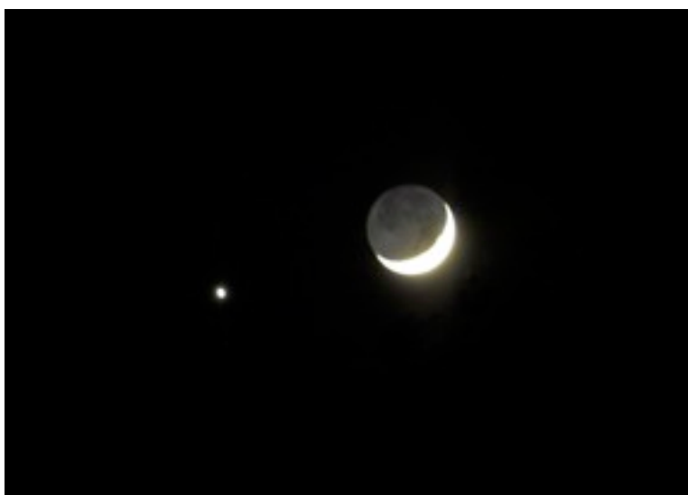
Long exposure of Venus and the Moon, showing Earth-shine on the Moon, on May 19, 2007.